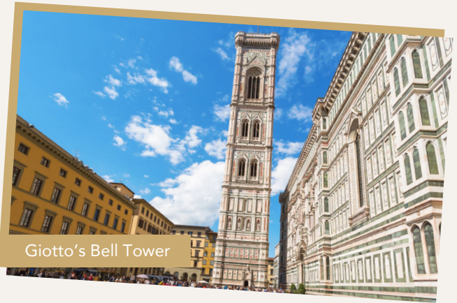
Giotto's Bell Tower